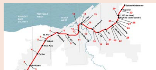
Source: Red Line Public Art Plan

For more information on the Red Line Public Art Plan, visit www.RideRTA.com