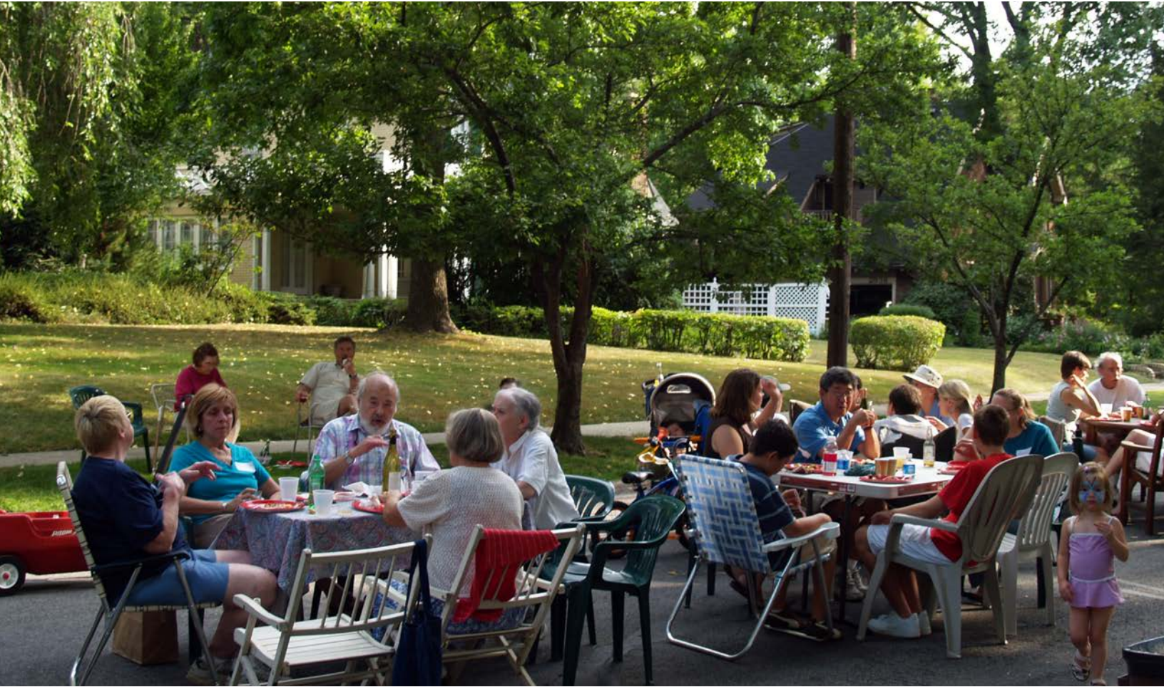
City of Cleveland Heights